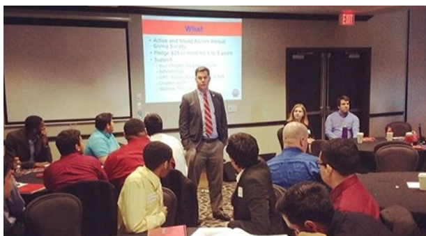
This year's Regional Leadership Alliance brought brothers in from every Texas chapter: Texas A&M University, University of Texas—Dallas, Schreiner University, University of the Incarnate Word, and St. Mary's University.