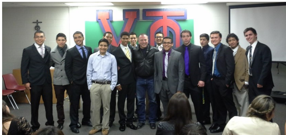
Brothers gather in badge attire after the Candlelight Ceremony