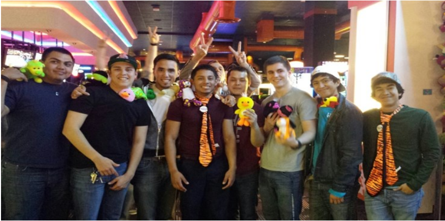
Recruitment Week Fun at Dave and Buster's

Spring Recruitment was a great success as it helped bring in fourteen new members to our fraternity. This the largest pledge class in several years, with new members that bring greater diversity and a refreshing new energy.